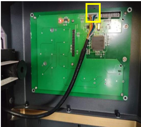
cable Connecticut on screen

1-1 Check the cables connection in good condition between screen and mainboard.